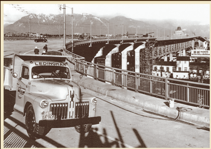
LEDINGHAM & CO. TRUCK ON THE GRANVILLE STREET BRIDGE, 1950'S