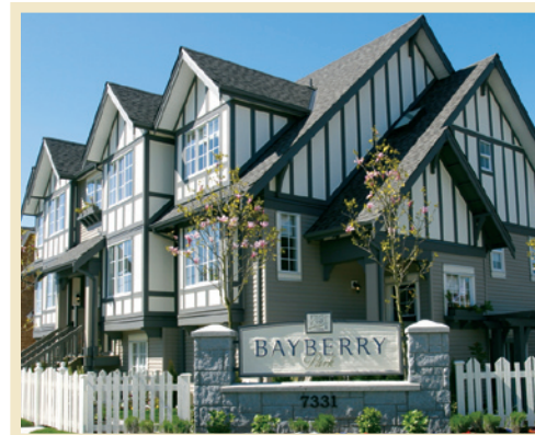
BAYBERRY PARK, RICHMOND