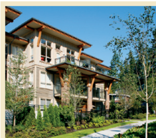
TOUCHSTONE, NORTH VANCOUVER