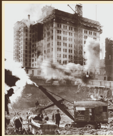
EXCAVATION FOR THE HUDSON BAY CO., 1911